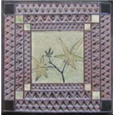
Item # 6TBF-GBOG: Botanical Green, Green Squares, Oxide Pts