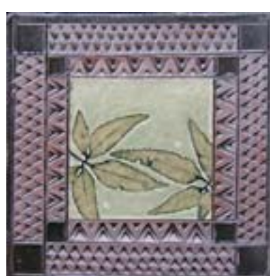
Item# 6TB-GBO: Botanical Green, Black Trim, Oxide Pts