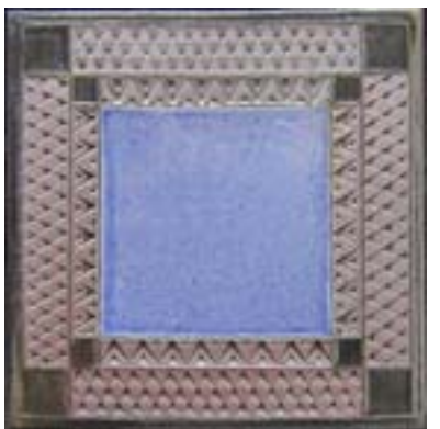
Item # 6TP-BBO: Plain Blue, Black Trim, Oxide Points

Not Pictured: #6TB-CBO Botanical Caramel, Black Trim, Oxide Points