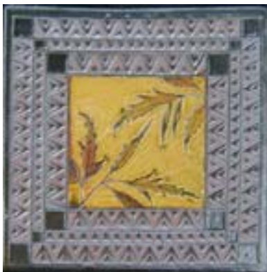
Item # 6TB-ABO: Botanical Amber, Black Trim, Oxide Points