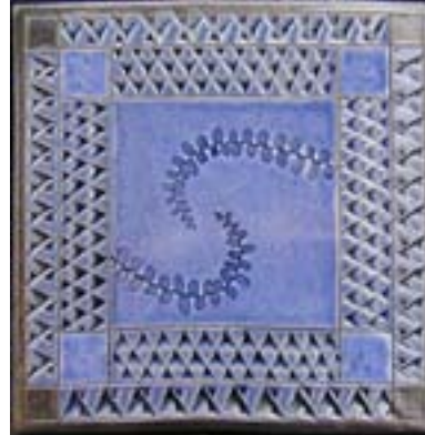
Item # 6TB-BBGB: Botanical Blue, Blue Squares, Glazed Pts