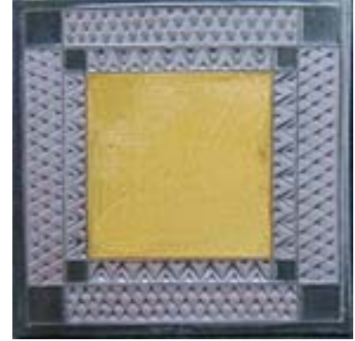
Item # 6TP-ABO: Plain Amber, Black Trim, Oxide Points