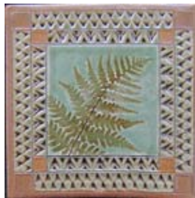
Item # 6TB-GGGG: Botanical Green, Gold Trim, Glazed Points