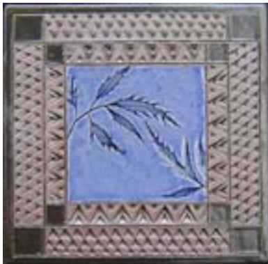
Item # 6TB-BBO: Botanical Blue, Black Trim, Oxide Points